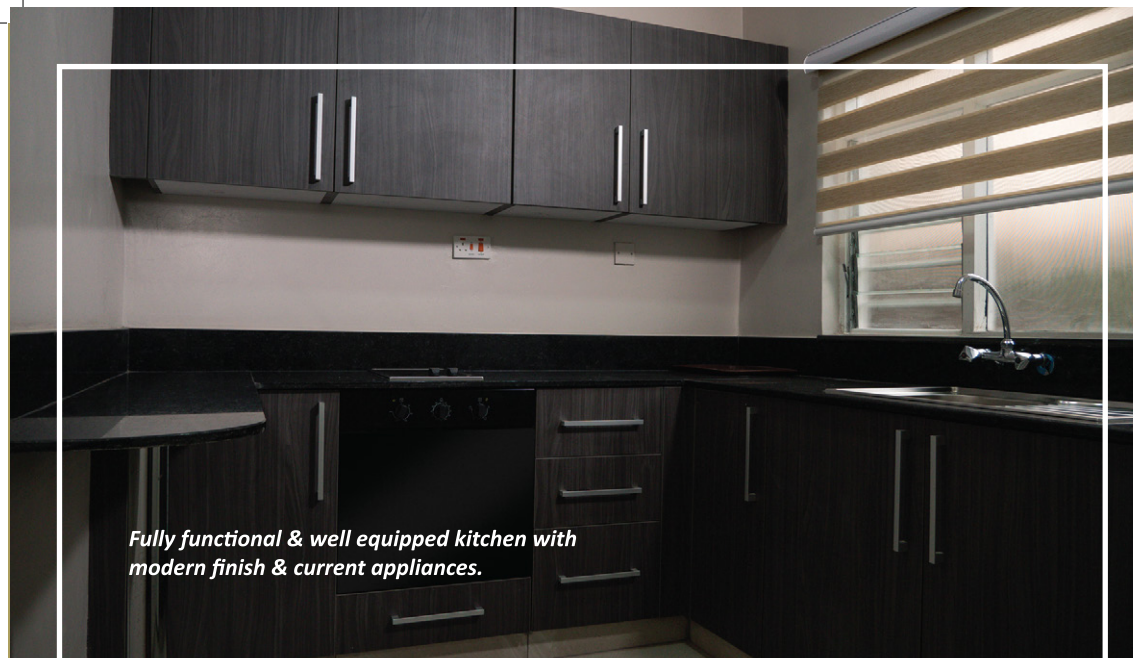
Fully functional & well equipped kitchen with modern finish & current appliances.